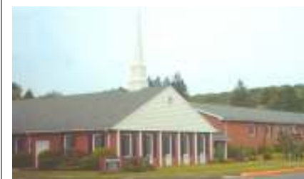
First Baptist - corner of Pearl St. & Central Ave.