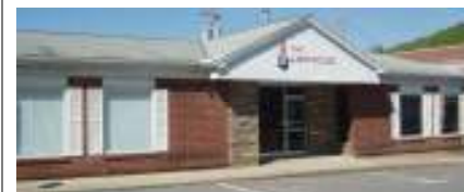
“The Lighthouse” Youth Ministry Building - Crafton Street