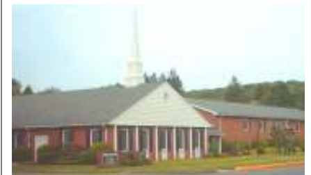
First Baptist - corner of Pearl St. & Central Ave.