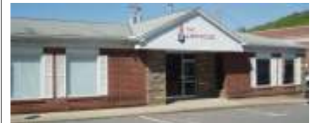
"The Lighthouse" Youth Ministry Building - Crafton Street